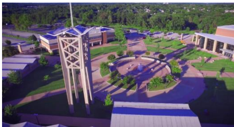
Location: Chesterfield, Missouri (St. Louis metropolitan area)

Logan's 112-acre wooded campus is located in Chesterfield, Missouri, a quiet residential suburb of St. Louis. MSNBC selected Logan's campus as an editor's pick of one of "America's Most Beautiful College Campuses." Logan offers an outstanding benefits package to eligible employees including free chiropractic care. Learn more about Logan University at www.logan.edu .